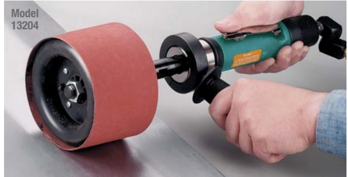
13204 Dynastraight® powers optional 94472 Dynacushion® pneumatic wheel on stainless steel.