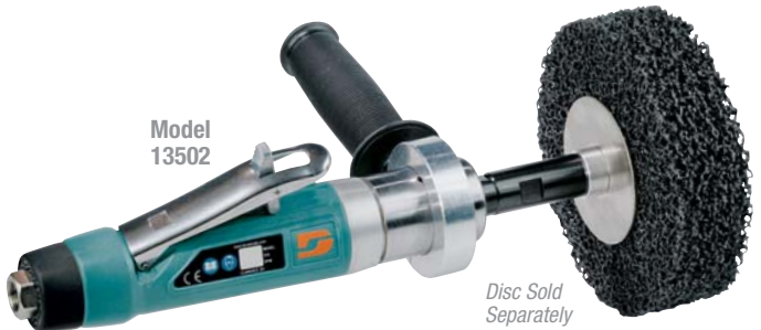
Disc Sold Separately

See page 248 for detailed arbor information.