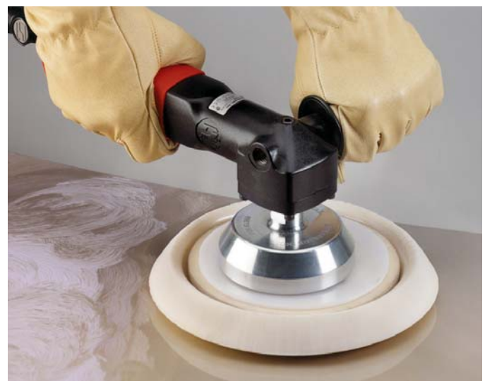
Air Model 10786 shown with optional Foam Pad

61374 Random Orbital Conversion Head Kit also available separately – see page 43.