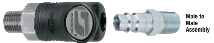
Male to Male Assembly