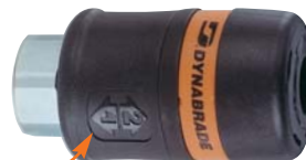
Female Safety Coupler