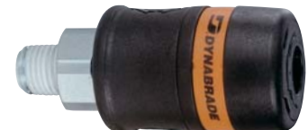
Male Safety Coupler