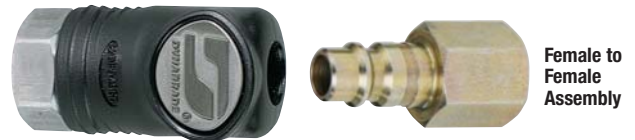
Female to Female Assembly