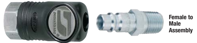
Female to Male Assembly