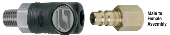
Male to Female Assembly