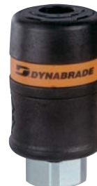
Male to Female Assembly