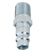
Female to Male Assembly