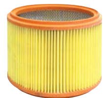
64684 H.E.P.A. Filter