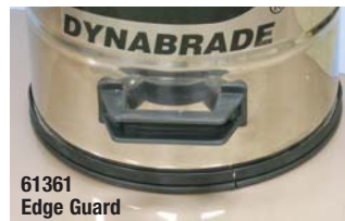
61361 Edge Guard