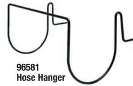
96581 Hose Hanger