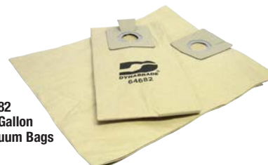
64682 9.9 Gallon Vacuum Bags