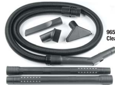
96558 Cleaning Kit