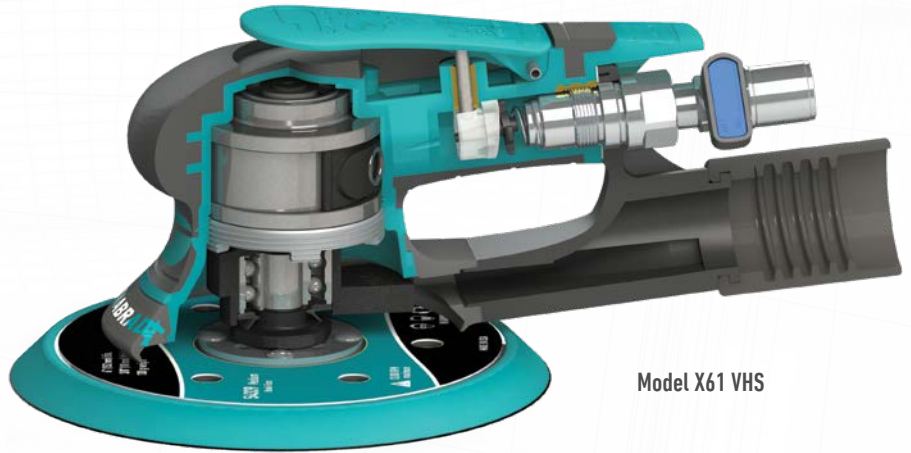
Model X61 VHS