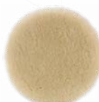
Dynacut™ Wool Polishing Pads Page 92