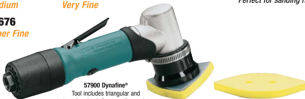
57900 Dynafine® Tool includes triangular and tear drop hook-face sanding pads.