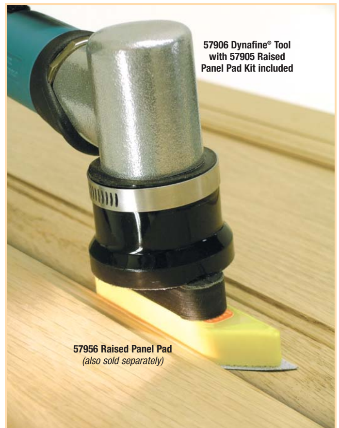
57906 Dynafine® Tool with 57905 Raised Panel Pad Kit included