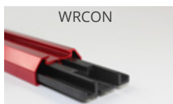
Wrench Rack connector 3 pack sold separately