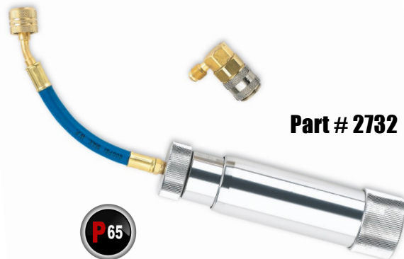
Part # 2732