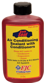
Part #s 9160