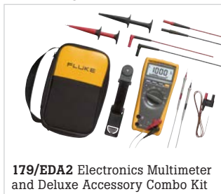
179/EDA2 Electronics Multimeter and Deluxe Accessory Combo Kit