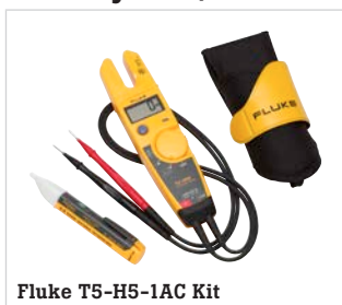
Fluke T5-H5-1AC Kit