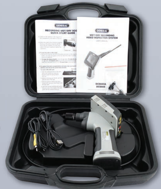
A packaged DCS660A system