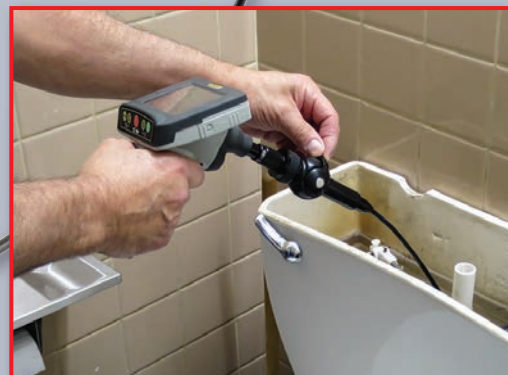
Ideal for all plumbing-related inspections