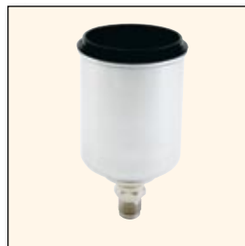
PN 289321 (p. 25)