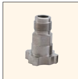
PN 289520 (p. 26)