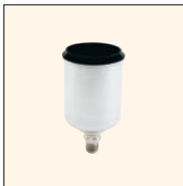
PN 289517 (p. 25)