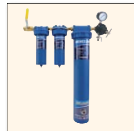
PN 6760 (p. 18)