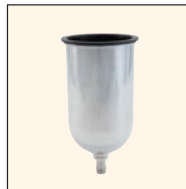
PN 253978 (p. 24)