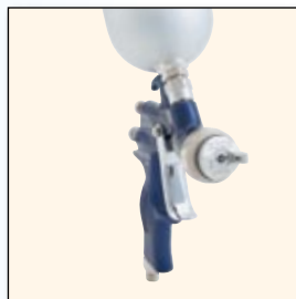
PN 253438 (p. 9)