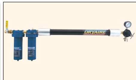
PN 6770 (p. 17)