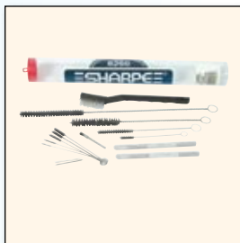
PN 8260 (p. 30)