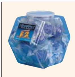
PN 8125 (p. 30)