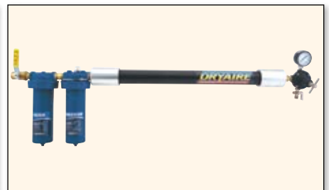
PN 6770 (p. 17)