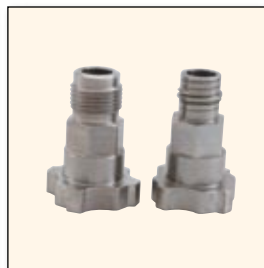
PN 253969 (p. 26)