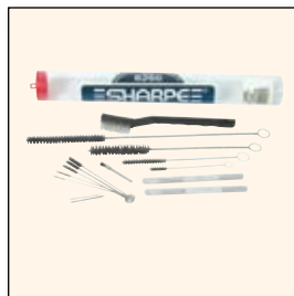
PN 8260 (p. 30)