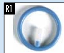
Pin and O-Ring