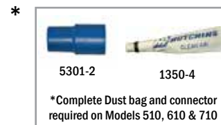
* Complete Dust bag and connector required on Models 510, 610 & 710

** Models 520, 523, 620, 623, 720, 723 & 810 Kit require either 5301-2 or 5301-5 to complete vacuum connection