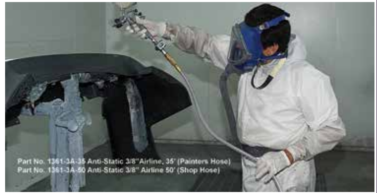
Part No. 1361-3A-35 Anti-Static 3/8" Airline, 35' (Painters Hose) Part No. 1361-3A-50 Anti-Static 3/8" Airline 50' (Shop Hose)

Clear, crushproof, reinforced construction allows instant detection of airborne contamination. The anti-static design decreases electrical charge to improve metallic orientation for both solvent & water based paints. Reduces static charge and dust build-up on plastic parts and bumpers. The lightweight, durable design with a large inside diameter improves airflow for better spray gun and air tool operation.