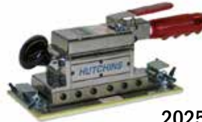
2025 13/16" Stroke