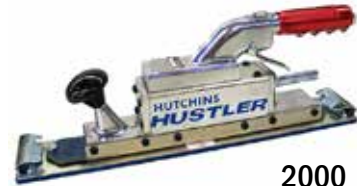
2000 15/16" Stroke

All Hutchins Straightline sanders have dual cylinders with a common piston and vertically-engaged, twin-drive gears. This double rack and pinion gear assembly gives twice normal gear contact for maximum balance, thrust and longevity.