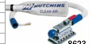
8623 13/16" Stroke