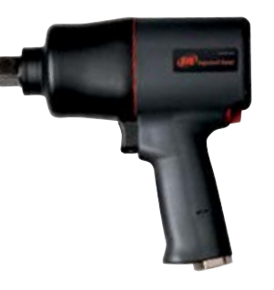
The best power-to-weight ratio in its class