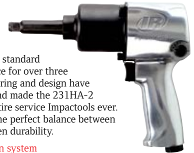
Top choice in tire service centers