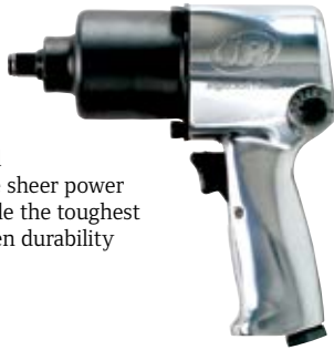
The most popular Impactool in the world