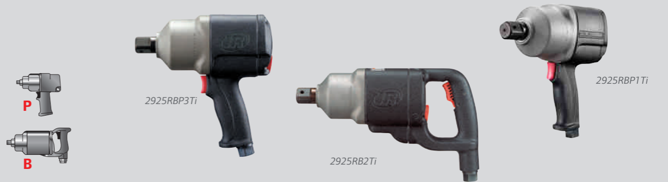
Technical Specifications at 6.2 bar (90 psi) dynamic pressure at inlet