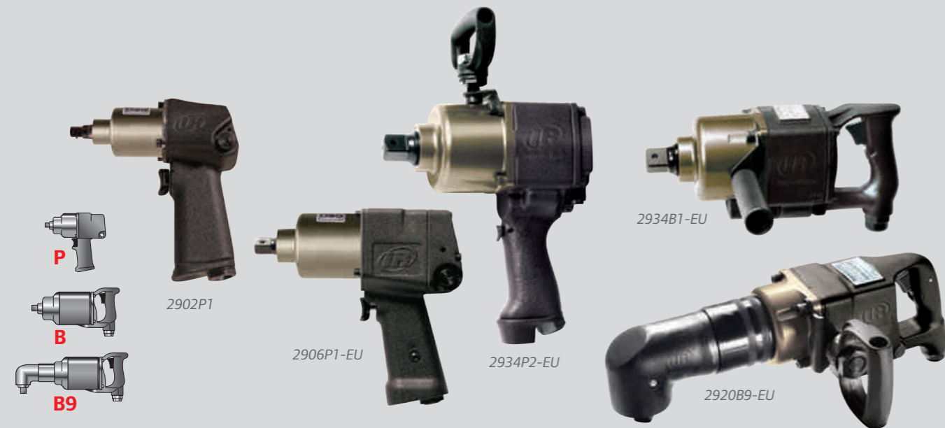
Technical Specifications at 6.2 bar (90 psi) dynamic pressure at inlet