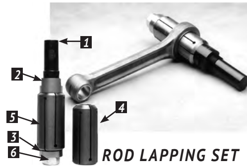
ROD LAPPING SET

Arbor assembly includes 1-1/2" and 1-5/8" laps. For lapping compound, use JIMS® No.1083 Course, No.1084 Fine. For more details see No.96740-IS instructions.