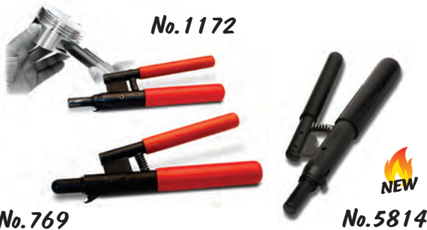
WRIST PIN CLIP REMOVER & INSTALLER

Use this tool to easily remove and install wire type wrist pin clips without damage to the piston.