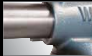
PRECISION SLIDE BAR