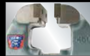
LARGEST WORKING CAPACITY