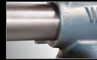
PRECISION SLIDE BAR