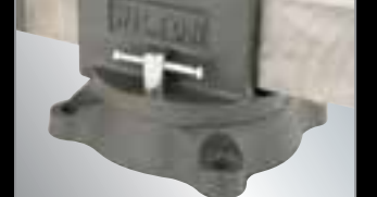
4 MOUNTING POSTS