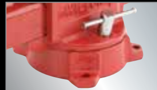
4 MOUNTING POSTS