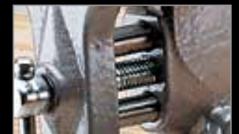
DOUBLE STEEL GUIDE BARS

NOTE: • Clamp-On Meets federal spec #GGG-V-410a