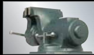
FULLY ENCLOSED DESIGN