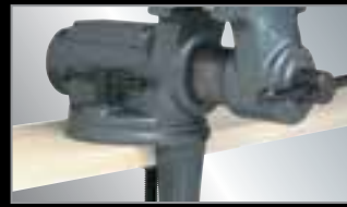
LIGHTWEIGHT AND PORTABLE