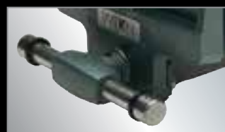
STURDY STEEL HANDLE