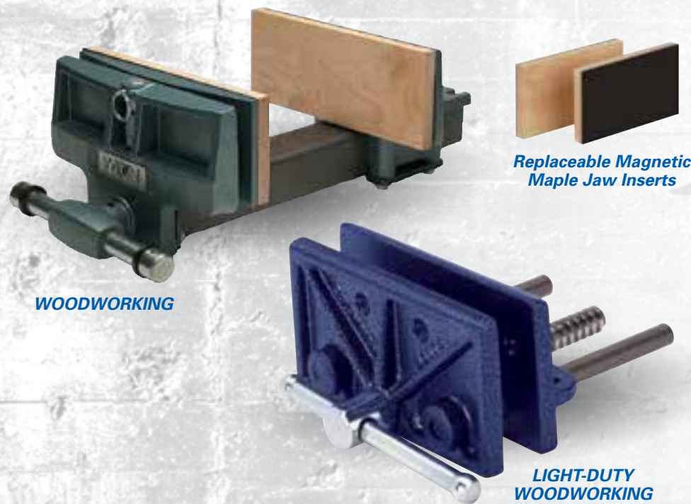
Replaceable Magnetic Maple Jaw Inserts