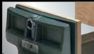
SELF CENTERING JAW