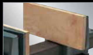
REPLACEABLE MAPLE JAW INSERTS