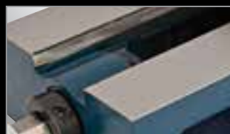
FLAME HARDENED BED