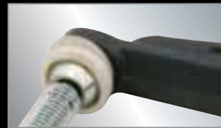
NYLON CAPS/FOOT INSERTS