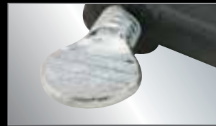
ZINC PLATED SCREW