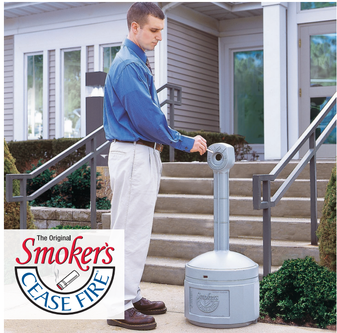
Ideal for any establishment—clean grounds help maintain your business image.

Large covered head dissipates heat and keeps rain out