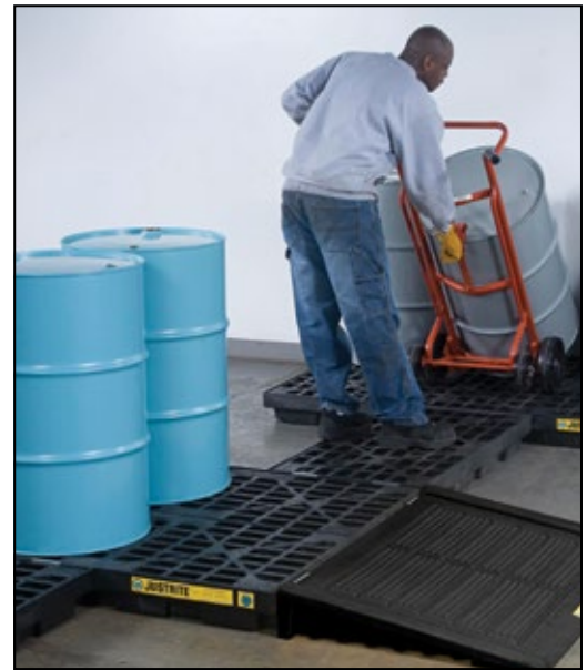
Modular design lets you join centers together to fit your space and application.

Load and unload heavy drum with ease. Anti-skid ribs provide maximum safety. Place the ramp anywhere on accumulation centers size 2-drum or larger.