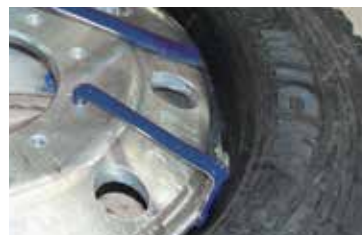
CURVED END For mounting and demounting top bead