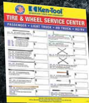
Eye-catching 15" x 17" full color display card with photos and descriptions!