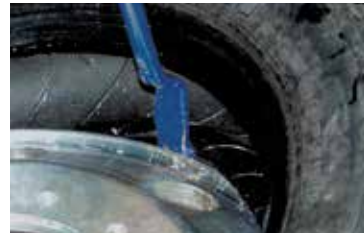
BENT END For mounting and demounting bottom bead

Nineteen-Five™ bars are specially designed to work on the hub side to make your job easier, faster and safer! New tire bar uniquely designed to work on hubside of wheel — where hub protrudes above rim. Specially designed ends manipulate tire with less effort. Tools are powder coated to protect from rust and corrosion. Forged from 3/4" diameter high-grade carbon steel and heat-treated for long-lasting strength and durability.