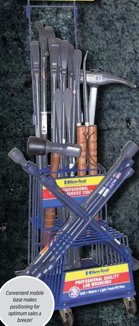
Convenient mobile base makes positioning for optimum sales a breeze!