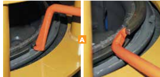
Pry-out end reaches behind slotted end of split ring to pry it out and over the flange of the wheel