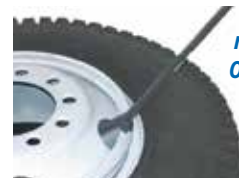
Use for multi-piece wheels, especially hub type.

Herramienta para anillos de seguridad de alta resistencia Outil robuste pour anneau verrouilleur Length: 37" (94 cm) Stock: 3/4" (19 mm) Weight: 4.6 lbs (2.1 kg)