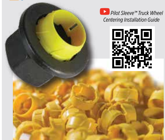
Pilot Sleeve™ Truck Wheel Centering Installation Guide