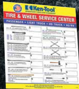
Eye-catching 15" x 17" full color display card with photos and descriptions!