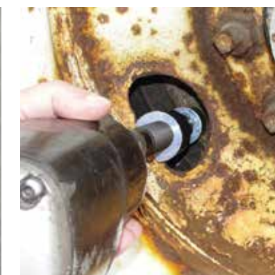
Pusher is ball bearing-driven for near-zero turning resistance and is heat treated for long-lasting strength and durability