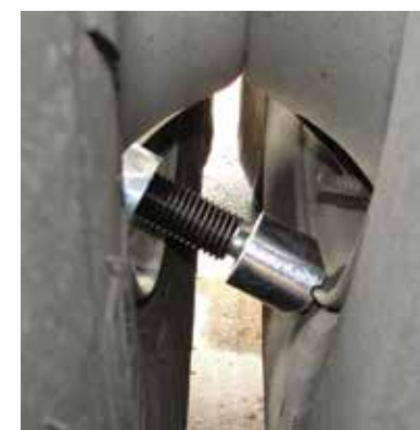
Components have black oxide or bright nickel plating finish for rust and corrosion resistance

Includes two pullers to cover large truck, trailer and smaller light truck dual wheel applications