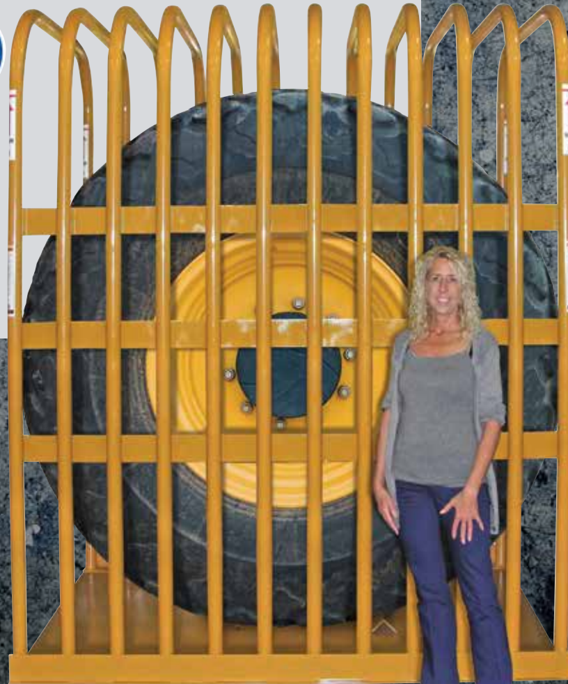
Earthmover 12-Bar Tire Inflation Cage

Work safely. Always use an inflation cage when inflating tires. Follow OSHA regulation 29-CFR Part 1910.177 whenever changing tires.