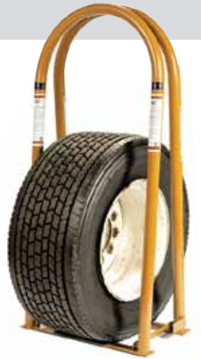
MAGNUM™ 5-BAR CAGE 36009 T109

Caja de 5 barras Magnum Cage à 5 barres Magnum