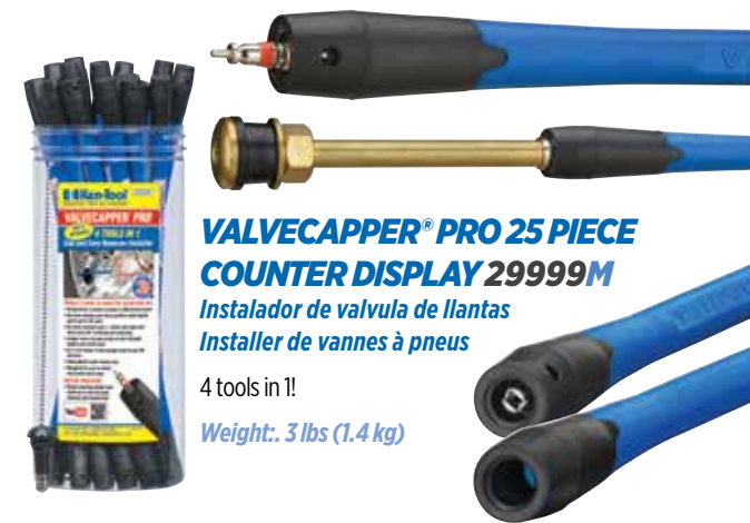
VALVECAPPER® PRO 25 PIECE COUNTER DISPLAY 29999M Instalador de valvula de llantas Installer de vanne à pneus