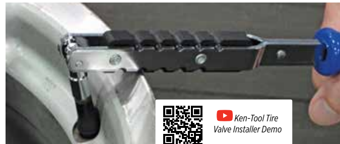
Ken-Tool Tire Valve Installer Demo