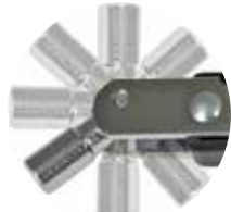
Swivel head allows for ease of use at any angle