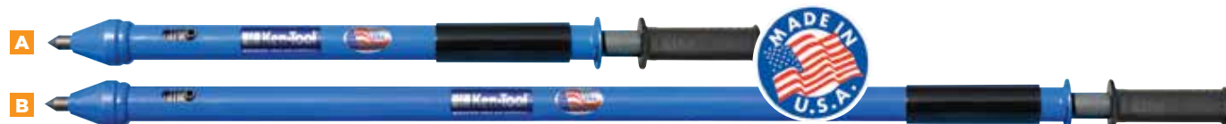
VALVE BREAKER™ Herramienta para romper válvulas Valve Breaker™ Outil casse-valve Valve Breaker™

Now Available in Steel and Alloy Models!