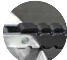
Polymer rim guard doesn't mar or damage chrome or alloy wheels

Length: 12" (30.5 cm) Weight: .6 lbs (.27 kg)