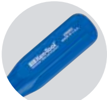
Slip resistant ergonomic handle feels great in hand