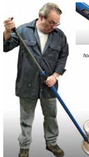
Solid ram bar (not hollow pipe) drives more energy into valve