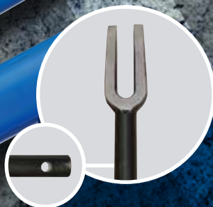
35939-01: T39B-1 TIE ROD FORK FORK OPENING: 5/8" (2 CM)