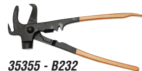
35355 - B232 Standard Wheel Weight Tool