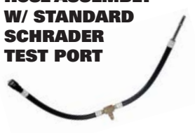
74492 5/16" QUICK DISCONNECT HOSE ASSEMBLY W/ STANDARD SCHRADER TEST PORT