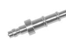
74851 DEADHEAD ALUMINUM ADAPTER