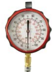
74424 M91/100 PSI GAUGE