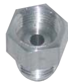
72317 ADAPTER ASSEMBLY