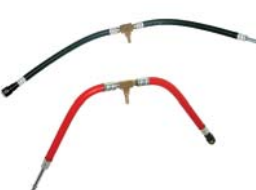
74487 HOSE ASSEMBLY: 74484 & 74485