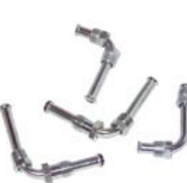
74494 GM TUBING KIT