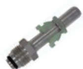
72320 ADAPTER ASSEMBLY