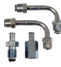
72323 ADAPTER KIT