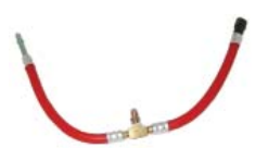
74493 3/8" QUICK DIS- CONNECT HOSE ASSEMBLY W/ STANDARD SCHRADER TEST PORT