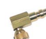
74853 SMALL SCHRADER RIGHT ANGLE ADAPTER