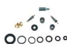
74437 REPAIR PARTS KIT