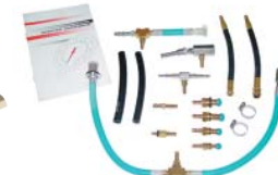
74445 UPGRADE KIT (EXCEPT CIS/TBI)