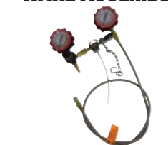
74701 GAUGE & HARD- WARE ASSEMBLY