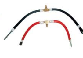
74488 HOSE ASSEMBLY: 74492 & 74493