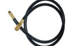
74476 6-FT. ROAD TESTER HOSE