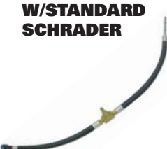
74499 1/4" QUICK DIS- CONNECT HOSE W/STANDARD SCHRADER