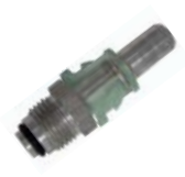
72319 ADAPTER ASSEMBLY