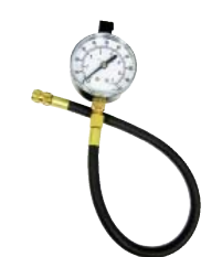
74571 GAUGE & HOSE ASSEMBLY