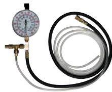
74438 M91/100 PSI GAUGE HOSE AND RELIEF VALVE