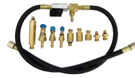
74444 BOSCH CIS UPGRADE KIT