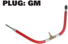
74485 3/8" QUICK DIS- CONNECT HOSE ASSEMBLY W/ QUICK COUPLER PLUG: GM