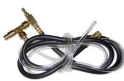
74425 RELEASE VALVE TUBING