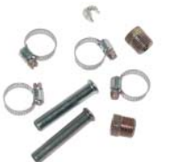
74455 TUBING KIT 3/8" TUBE W/ INVERTED FLARE NUTS & HOSE CLAMPS