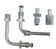
72322 ADAPTER SET CONSISTING OF: 60236, 72305, & 72306