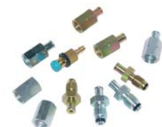
74495 GM ADAPTER KIT