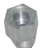
72318 ADAPTER ASSEMBLY