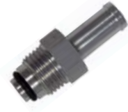
72316 ADAPTER ASSEMBLY