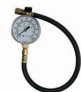
74440 M68/100 PSI GAUGE AND HOSE