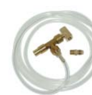
74446 RELIEF VALVE AND TUBING ASSEMBLY