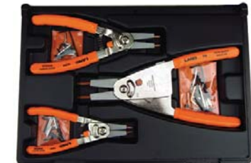
1465 3-PC. QUICK SWITCH RETAINING RING PLIERS SET