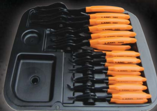
3495 12 PIECE COMBINATION INTERNAL/EXTERNAL SNAP RING PLIERS SET