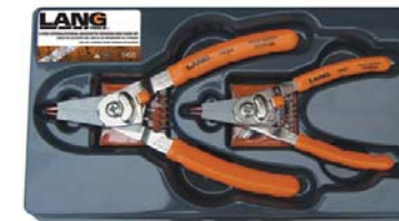
1450 2-PC. QUICK SWITCH RETAINING RING PLIERS SET