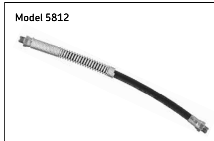
Strategically placed coil spring provides nonslip, push-pull grip and prevents accidental kinking which could cause hose ruptures.