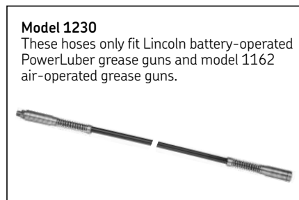
Model 1230 These hoses only fit Lincoln battery-operated PowerLuber grease guns and model 1162 air-operated grease guns.