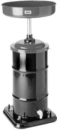
Drum not included