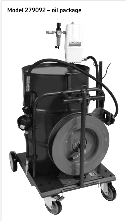
Model 279092 – oil package