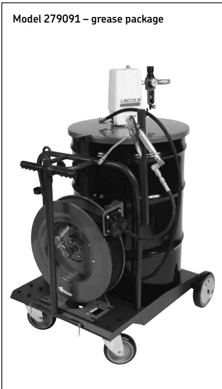
Model 279091 – grease package