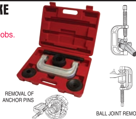
REMOVAL OF ANCHOR PINS