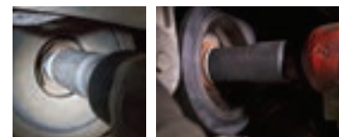
U.S. Pat No. 10,040,176